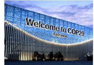
The COP29 summit venue in Baku.