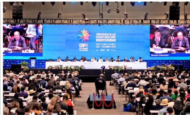
A view of the closing session at the COP16 summit in Cali, Colombia, November 1, 2024.

Momentum for finance: Negotiators also agreed to a new and upgraded process to identify ‘Ecologically or Biologically