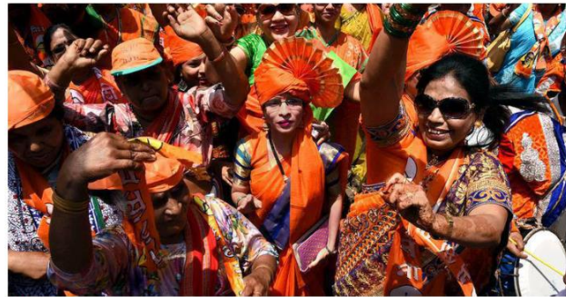
Behind the curtains: In India, candidates from all major parties breach the election expenditure limits by a wide margin. FILE PHOTO

In the U.S., the financing for elections happens primarily by contributions from individuals, corporations, and political action committees (PAC). While there are limits on individual and PAC contributions to candidates, various judgments of the U.S. Supreme Court have resulted in the creation of Super PACs on which there are no limits for spending. Out of the estimated expenditure in the November 2024 election cycle, around $5.5 billion is estimated to be spent on the presidential election. The balance is around $10.5 billion on elections to the House of Representatives and Senate of the U.S.