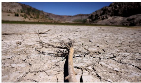
Parched land: COP16 had the largest-ever attendance of any UN land, drought talks to date.

This threatens agriculture, water security, and livelihoods of 1.8 billion people, with the poorest