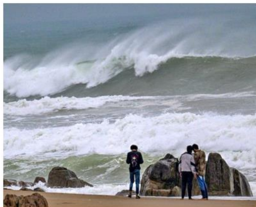
Tidal waves triggered by Cyclone Fengal lashed the R.K. Beach in Visakhapatnam on November 30.

Landfall is the moment in a tropical cyclone's life when its eye moves over land. Stormy weather brought by a cyclone is stronger around the eye, and landfall events can be deadly because they expose human settlements on land to strong winds and heavy rain. Their effects can be compounded by storm