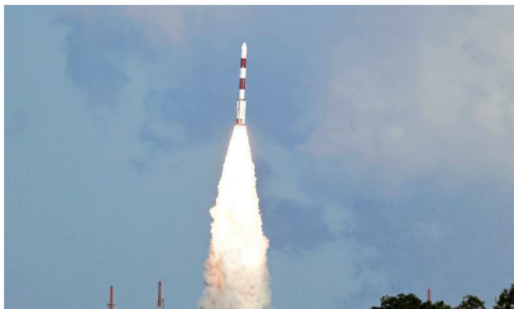
Roaring start: A PSLV-C59 rocket takes off with the PROBA-3 Mission from the Satish Dhawan Space Centre on Thursday.