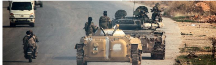
Dramatic offensive: Militants of the Hayat Tahrir al-Sham drive along a street in al-Rashideen, Aleppo province, Syria on November 29.

There are three main actors in Syria today. The most important actor is the regime, which is backed by Iran and Shia militias from Iraq and Russia. The second player is the Syrian Democratic Forces (SDF), which is basically an umbrella militia group involving the People's Protection Forces (PPF), the main Syrian Kurdish militia that controls Syrian Kurdistan (Rojava). From the early stages of the civil war, the regime and the YPG had entered into a detente. The Kurds, who got their relative autonomy, and the regime forces stayed away from targeting each other. The third actor is Hayat Tahrir al-Sham (HTS), the main anti-government force that is in control of Idlib. The Turkey-backed Free Syrian Army, which they today called the Syrian National Army