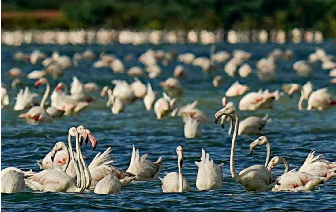
Flamingos are back at the Pulicat Lake near Sriharikota in Andhra Pradesh. With the onset of northeast monsoon, the lake is brimming, attracting flocks of migratory birds.