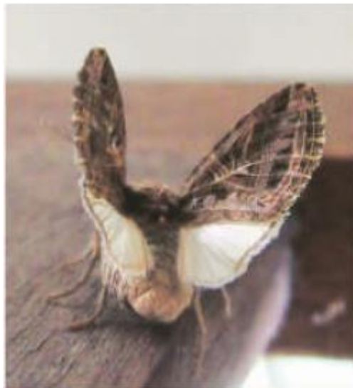
A moth species called Egyptian cotton leafworm can hear sounds emitted by stressed plants, the study said.