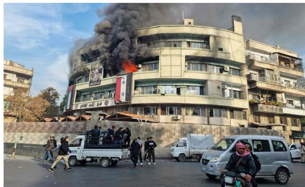
Tense situation: Flames sweeping through the criminal security branch of Syria's Interior Ministry in Damascus on Sunday.

"We celebrate with the Syrian people the news of freeing our prisoners and releasing their chains and announcing the end of the era of injustice in Sednaya prison," the HTS said, referring to a jail on the outskirts of Damascus where