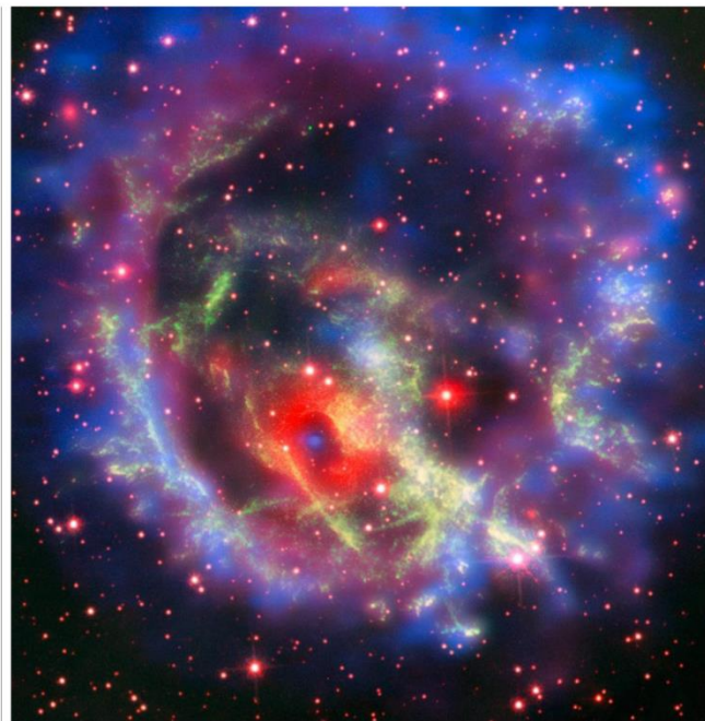
The blue spot at the centre of the red ring is an isolated neutron star in the Small Magellanic Cloud. Neutron stars are formed after heavy stars go supernova, in the process emitting gamma rays alongside radiation at other energies.

To ensure it can detect gamma rays in the required energy range, MACE's