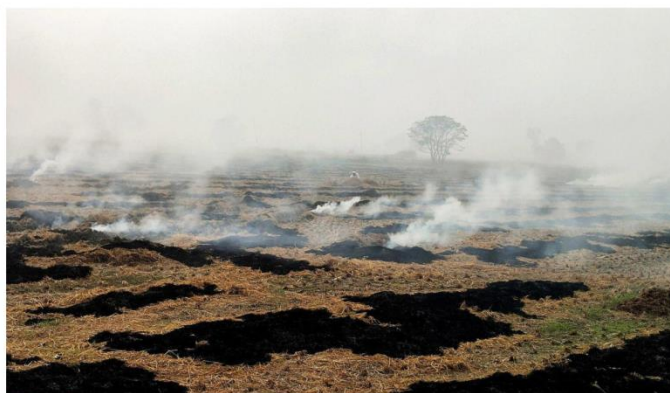
Billowing trouble: Stubble being burnt at a paddy field on the outskirts of Amritsar in Punjab earlier this month.

His post implied farmers were burning paddy stubble after the Aqua and