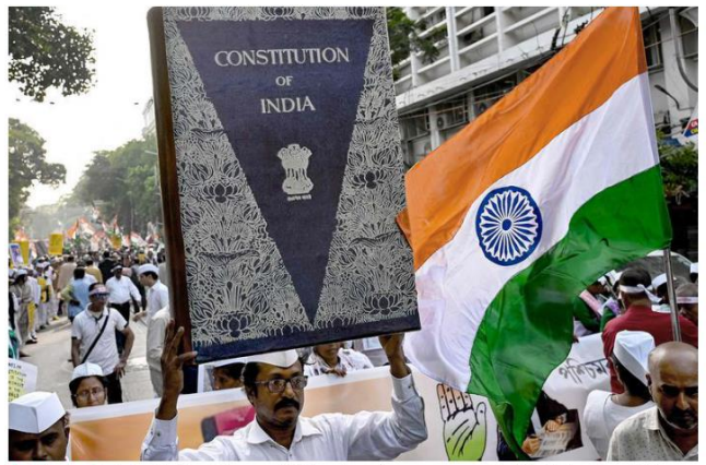
Guiding book: Indian National Congress (INC) party workers carry a model of the Indian Constitution during in rally on the occasion of Constitution Day celebrations in Kolkata on Tuesday.

In Berubari case (1960), the Supreme Court opined that the Preamble is not a part of the Constitution and thus not a source of any substantive power. Subsequently, in Kesavananda Bharati