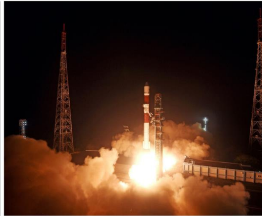
ISRO launches the PSLV-C60 from the Satish Dhawan Space Centre in Sriharikota on December 30, 2024.

On December 31, 2024, Manastu Space's Vyom 2U payload fired its green