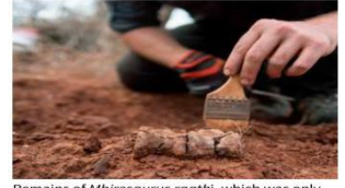
Remains of Mbiresaurus raathi , which was only about one metre tall, with a long tail, and weighed up to 30 kilograms, were found in Zimbabwe in 2019.