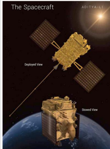
Aditya-L1 is India's first space-based observatory to study the sun. This artist's impression shows the spacecraft in its deployed and stowed configurations.