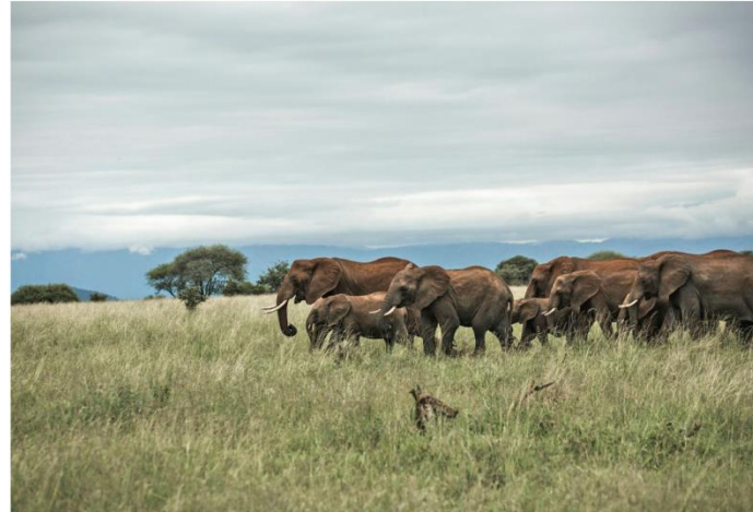
A herd of elephants follows its leader in Tarangire National Park, Tanzania.

He and his team analysed more than 9,800 peer-reviewed studies from 1900 to 2023, investigating the roles of elderly individuals in several species. These roles included knowledge transmission, assisted parental care, nutrient cycling,