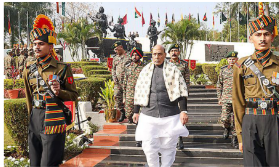
Defence Minister Rajnath Singh pays tributes to the brave-hearts at the Infantry Memorial at Mhow in Indore on Monday.

Mr. Singh said mastering frontier technologies is the need of the hour in the constantly evolving times, noting that military training centres are playing a crucial role in equipping