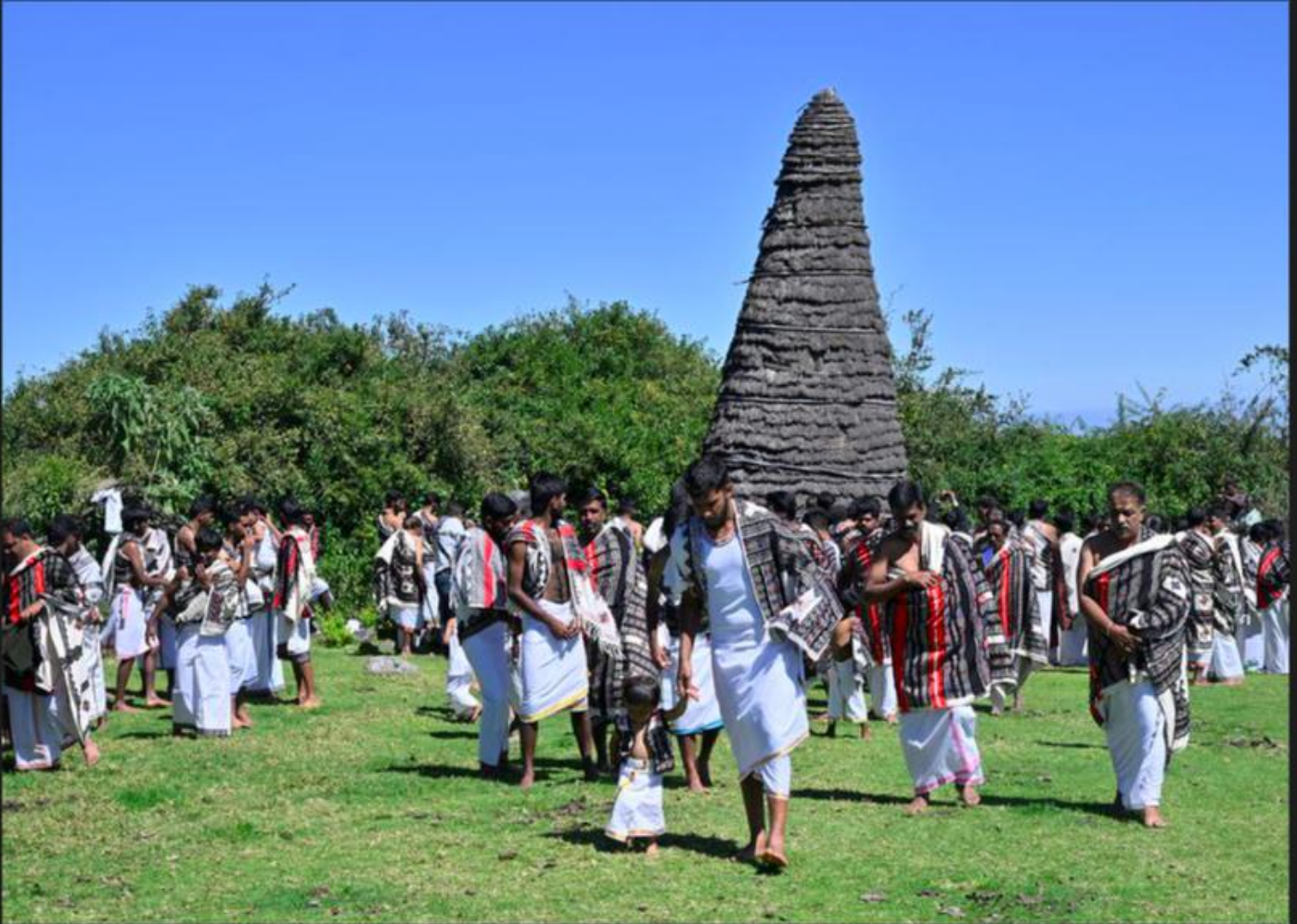
Revelry time: Members of the Toda tribe in the Nilgiris gather around a 'moonbo' (head) temple in the Muthanad 'mund' (hamlet) in Udhagamandalam on Sunday to celebrate the Modwerth festival and discuss plans for the year

Toda tribe in Nilgiris celebrates Modwerth festival, fostering cultural unity and planning for the community's progress in Udhagamandalam.