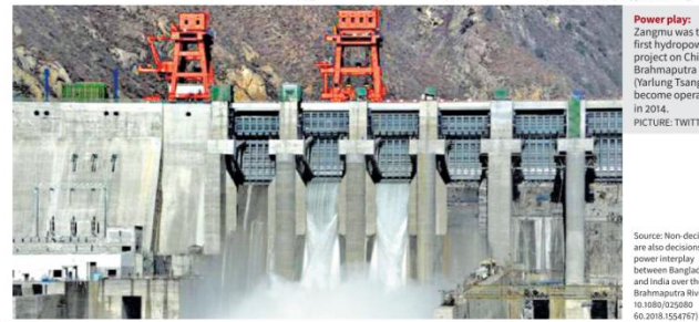
Power play: Zangmu was the first hydropower project on China's Brahmaputra (Yarlung Tsangpo) to become operational, in 2014.