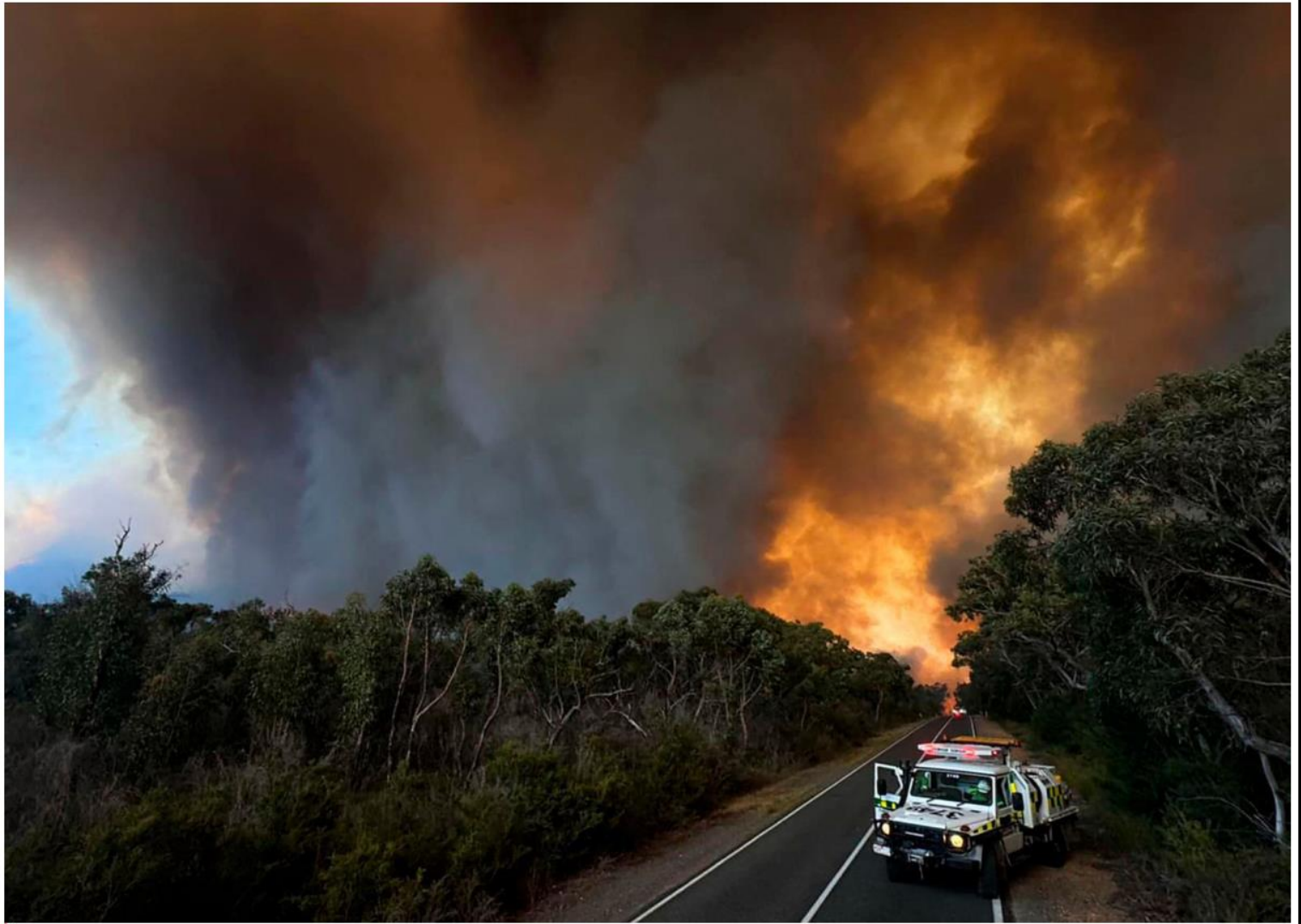
This handout image received on December 26, 2024, from the State Control Centre of the Victoria Emergency Services shows a bushfire in the Grampians National Park in Australia's Victoria state. The country's southeast is sweltering in a heatwave that has raised the risk of bushfires. The nation's weather forecaster said temperatures would be up to 14 degrees C above average in some areas.