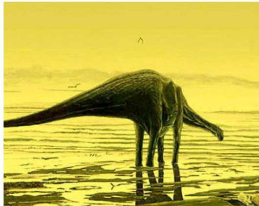
An artist's impression of sauropod dinosaurs on the Isle of Skye in this undated handout photo, December 2015.

The team found five trackways — or series of footprints — in all. They said