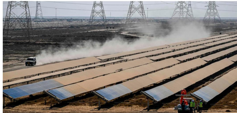
Workers install solar panels at the Adani Group-owned Khavda Renewable Energy Park in Khavda, Gujarat.

"This variation depends on atmospheric variables such as clouds, aerosols or particulate matter, water vapour, and radiatively active gas molecules such as ozone. Clouds reflect and aerosols either scatter or absorb incoming solar radiation reaching the surface. Therefore, on a cloudy or hazy day, due to particulate matter pollution, less solar radiation will impinge on the solar panel and reduce solar generation."