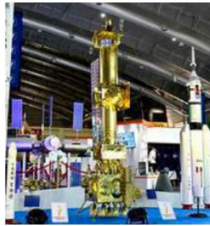
A model of Chandrayaan-4.

The Chandrayaan mission consists of studying the lunar surface. Chandrayaan-1, successfully launched in 2008, took