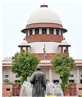
The court said Indian language laws were not rigid but accommodative.

"Though Hindi was selected as the official language, it could not be described as the national language, for, it was not the language generally spoken in all parts of India, and though spoken by the largest single group of people, that group did not constitute the majority of people in