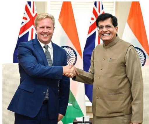
Deep dive: Commerce Minister Piyush Goyal with New Zealand Trade Minister Todd McClay in New Delhi on Sunday.

Prime Minister of New Zealand Christopher Luxon is here on a four-day vi-