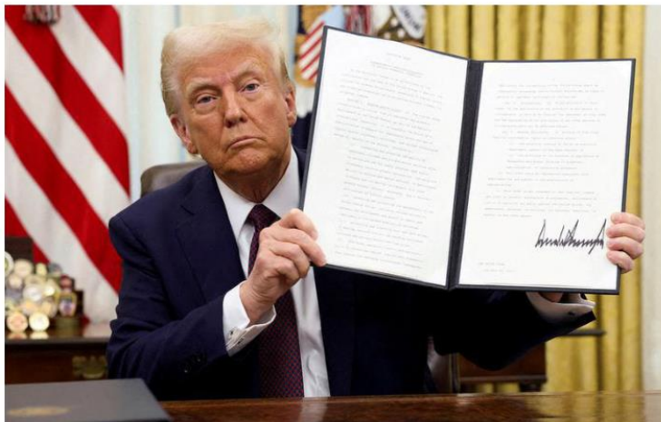
Utter chaos: Mr. Trump has already rattled markets and plunged many national currencies.

The essence of Mr. Trump's economic and trade policies can be summarised as follows: a) cut down the size of his nation's public debt, b) improve his country's trade balance with its major trading partners, c) woo businesses to relocate or to invest in the domestic economy through a policy of carrot and stick, d) make the American economy efficient by reducing its fiscal deficit, which involves cutting the size of its bureaucracy and eliminating unwanted expenditure on international aid, and e)