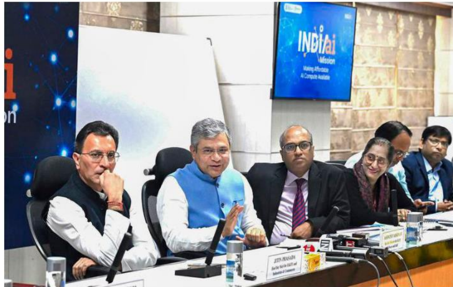
New realms: Union Minister Ashwini Vaishnaw along with others during announcement of various projects under IndiaAI Mission, in New Delhi.

The IndiaAI Datasets Platform is one of the seven pillars of the IndiaAI Mission, the Union government's main state-backed AI effort. The Mission has an outlay of ₹10,370 crore, and last month the Centre announced that under its Compute Capacity pillar, start-ups and academia would be able to use pooled access to graphics processing units (GPUs), which are needed to train and run AI models. Other than translation, the limited datasets include submissions from Telangana's own open data initiative, such as health data; 2011