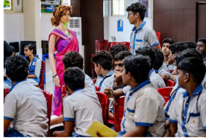
India's first AI teacher 'Iris' interacts with students at a school at Attingal in Thiruvananthapuram, Kerala.