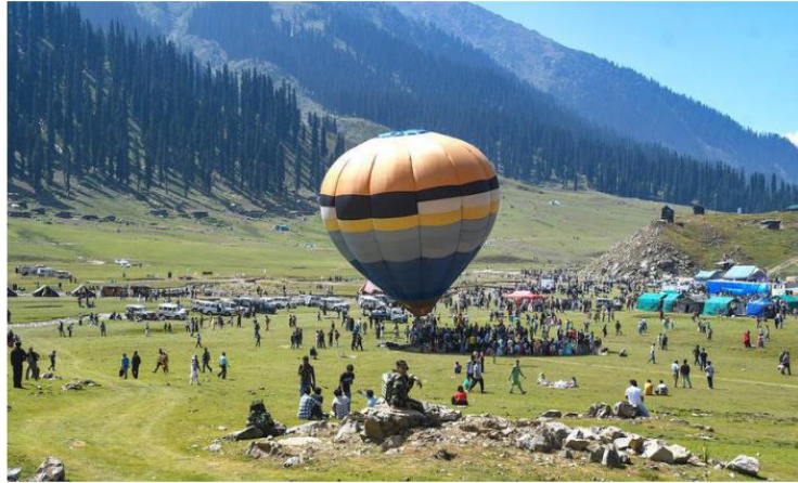
New destination: Tourists waiting for a hot air balloon ride at Bangus Valley in J&K. FILE PHOTO

"To maintain ecological balance, the department concerned has focused on avoiding construction of massive buildings and hotels. The aim would be to develop the area as an ecotourism destination," Chief Minister Omar Abdullah said, while speaking in the