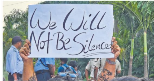
In rage, an agitator holds a poster during a protest over the death of a Nepali student on the Kalinga Institute of Industrial Technology (KIIT) campus, in Bhubaneswar, on February 19, 2021.

The latest available All India Survey on Higher Education (AISHE) data reveals that during 2021-22, 46,878 foreign students from 170 nations were enrolled in various institutes of higher learning in India