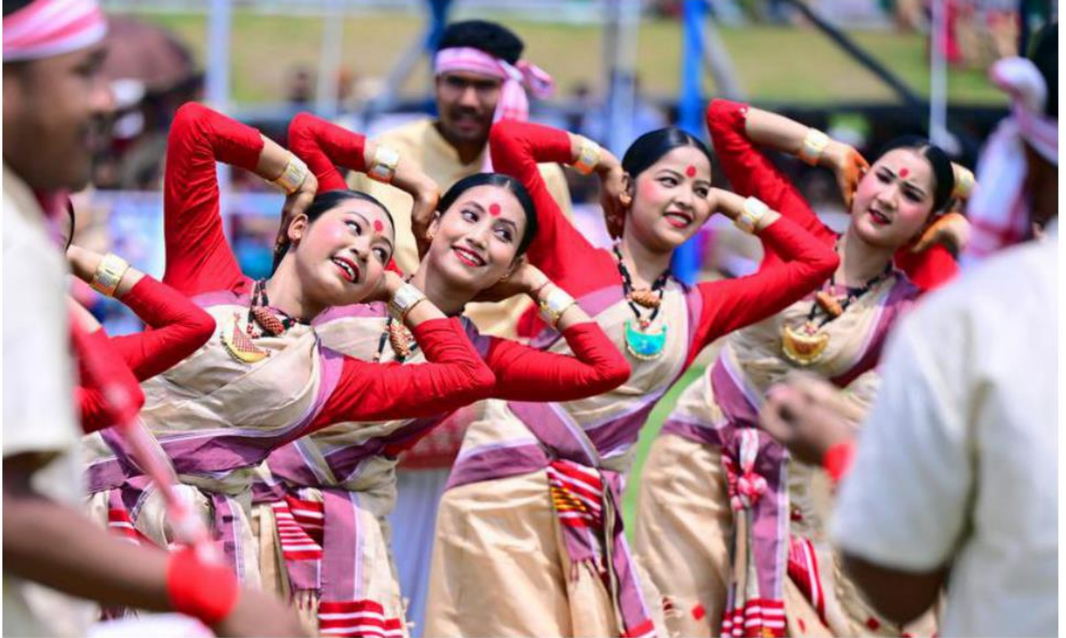
Rhythmic spirit: A troupe performs for Rongali Bihu, which marks the Assamese New Year, in Guwahati on Monday.