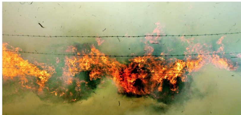
Toxic fumes: Stubble is burned to remove paddy crop residues from a field on the outskirts of Sangrur district in Punjab on November 2, 2024.