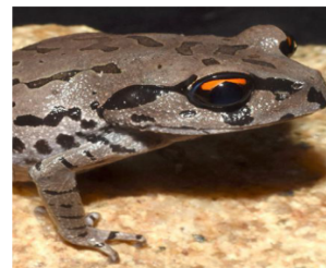
Leptobrachium aryatium , a new-to-science frog recorded from a reserve forest on the edge of Guwahati.