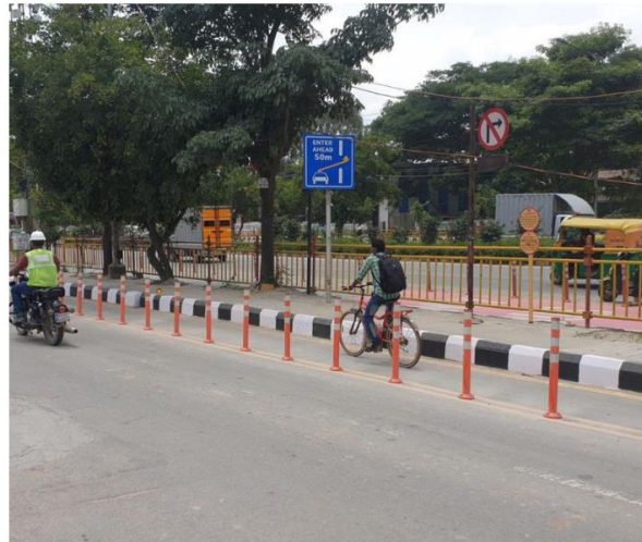
Towards a healthy city: Cycling lanes in Bengaluru.